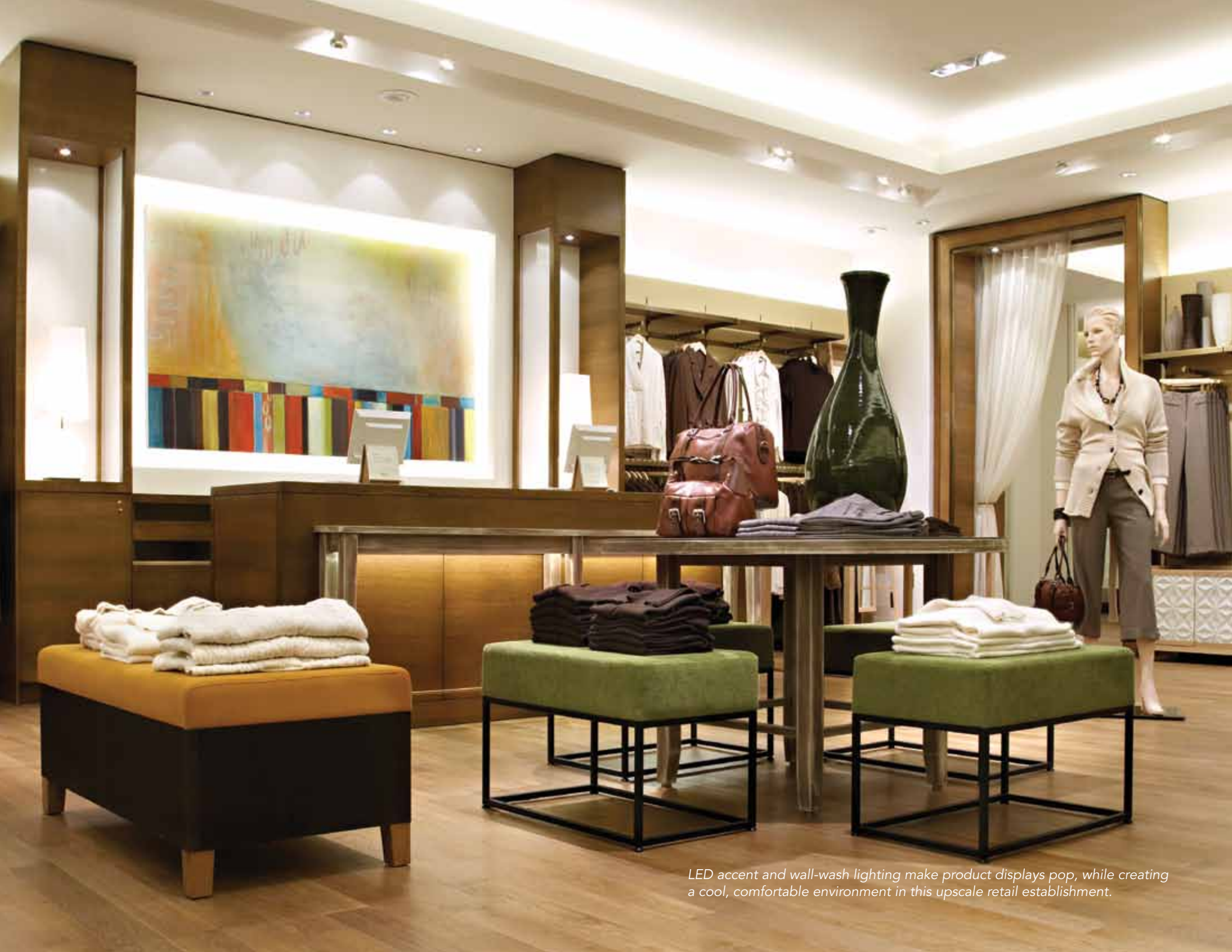
LED accent and wall-wash lighting make product displays pop, while creating a cool, comfortable environment in this upscale retail establishment.