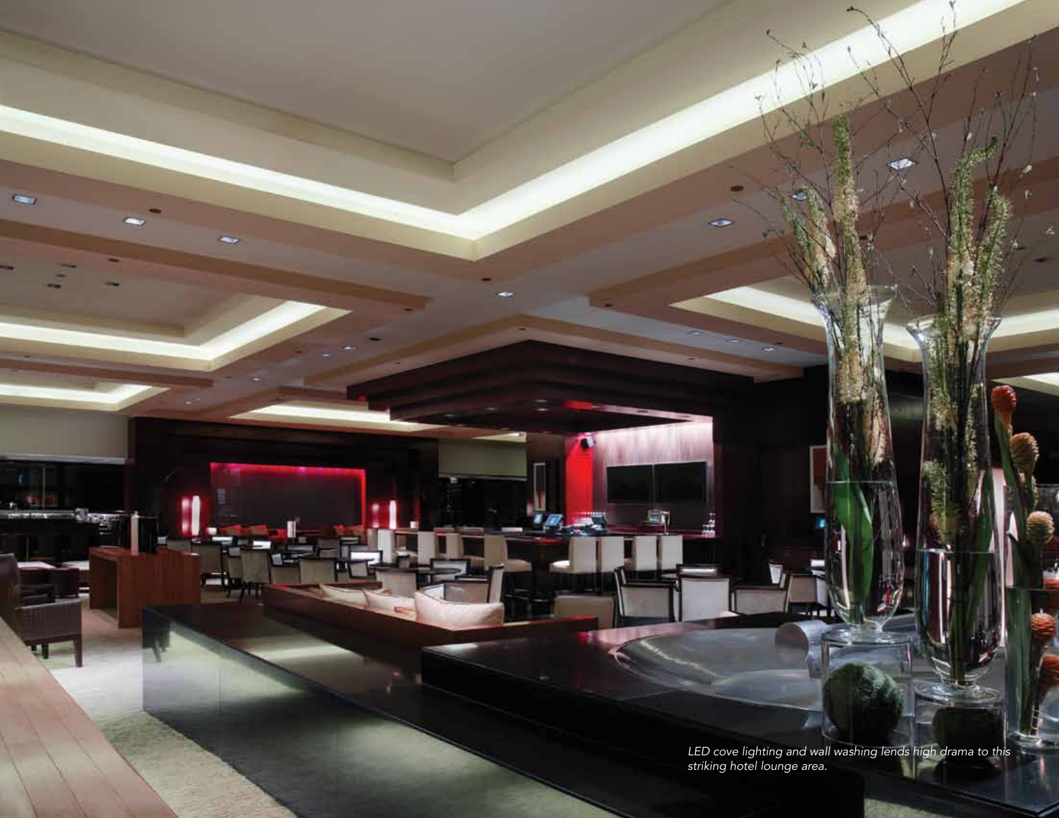
LED cove lighting and wall washing lends high drama to this striking hotel lounge area.