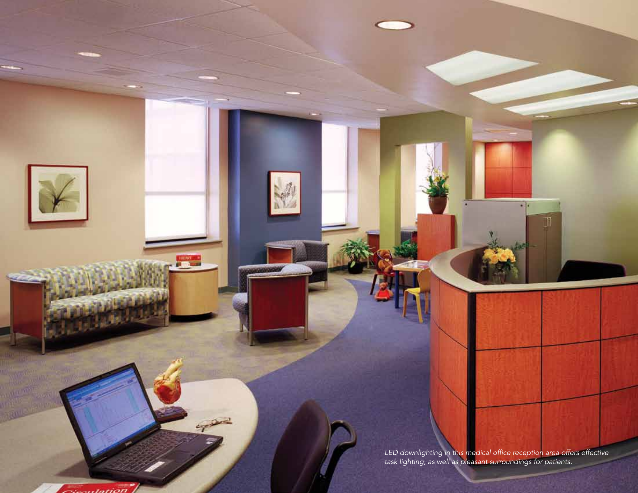
LED downlighting in this medical office reception area offers effective task lighting, as well as pleasant surroundings for patients.