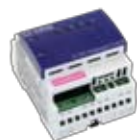
0-10 V Dimming