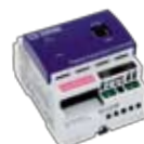
Pascal Automation Controller