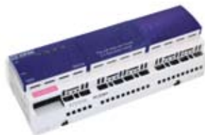
Phase Angle Dimmer