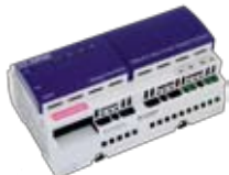
Multi Channel Relays