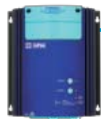
Professional Series Dimmer