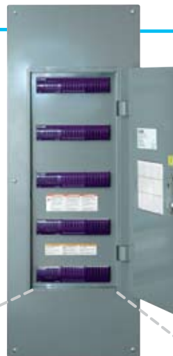
Model Shown: 60M Variety of Sizes Available