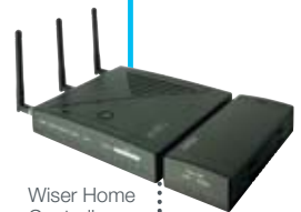
Wiser Home Controller